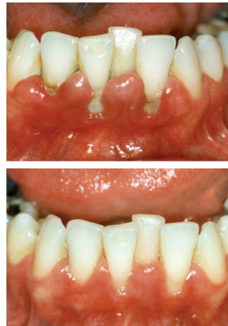
Top: Before Bottom: Nine days after LANAP

Drs. Gregg and McCarthy pioneered the use of the FR pulsed Nd:YAG laser in treating gum disease in the 1990s. They were astounded by their ability to regenerate bone growth (routine 50 percent defect fill) and stimulate new attachment for their own patients with severe gum disease. The results were too good to keep to themselves.