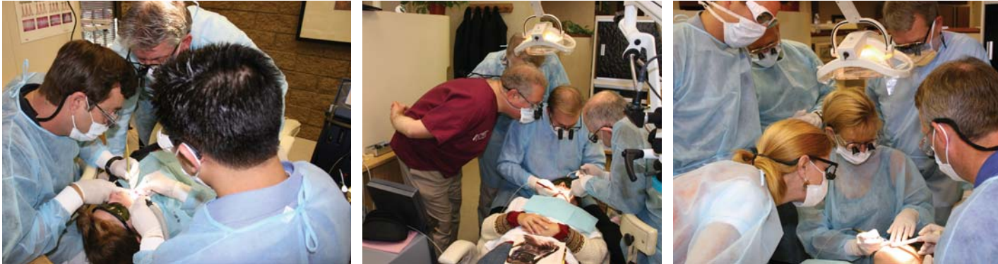
Live patient clinical hands-on training with direct instructor supervision

represents an option that includes both specialists and general practitioners in the solution. A general practitioner who might be reluctant to perform invasive surgery might welcome the opportunity to treat such an overwhelming health issue without referring patients elsewhere. Alternatively, the LANAP protocol practiced by periodontal specialists becomes a more attractive referral for general practitioners and their patients.