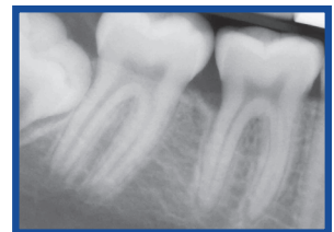
12 months Post-LANAP® Protocol