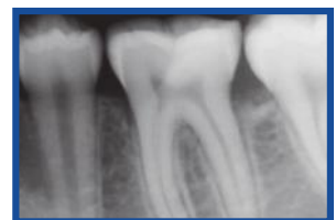
12 months Post-LANAP® Protocol